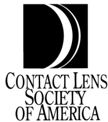
Exhibit Hall Schedule of Activities CLSA 55 th Annual Education Meeting April 7-10, 2010 Hyatt Regency Riverfront • Jacksonville, Florida

Preliminary Schedule - Subject to Change